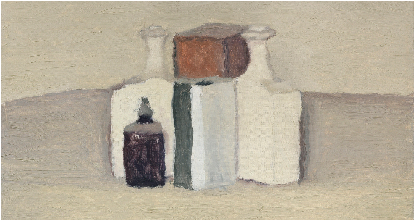
Giorgio Morandi, Natura morta , 1958