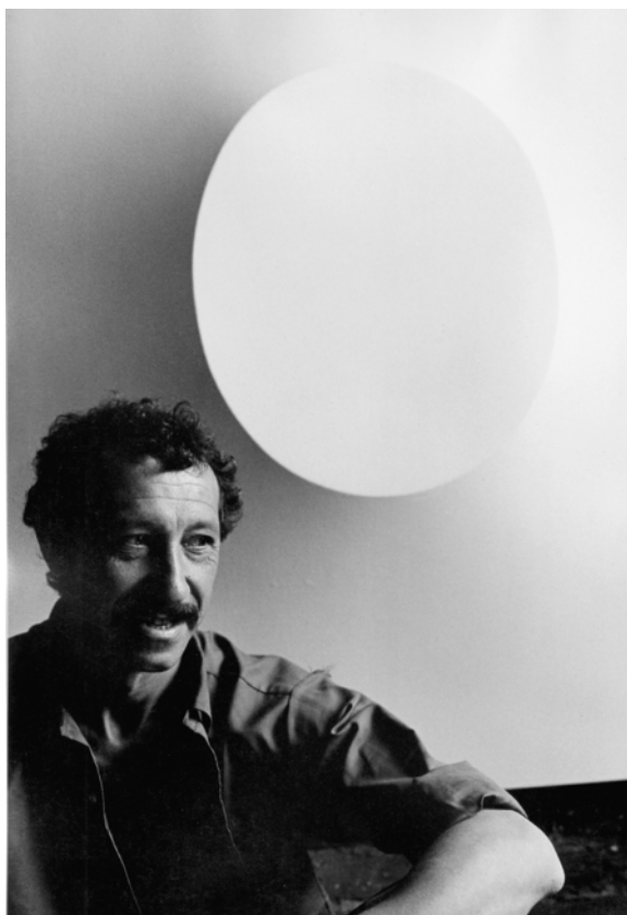
Turi Simeți during his show in New York in 1968.