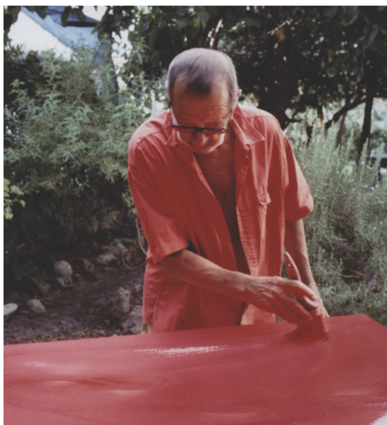
Turi Simeti dans son atelier milanais.

Exhibition October 10 until December 20, 2014