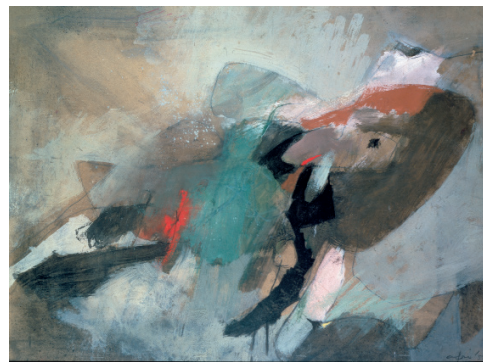
Study for The Garden of Hope , 1958 Mixed media on paper, 50.7 x 65.9 cm.