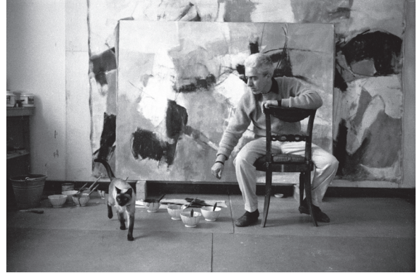
Afro with his cat Louis, 1958.