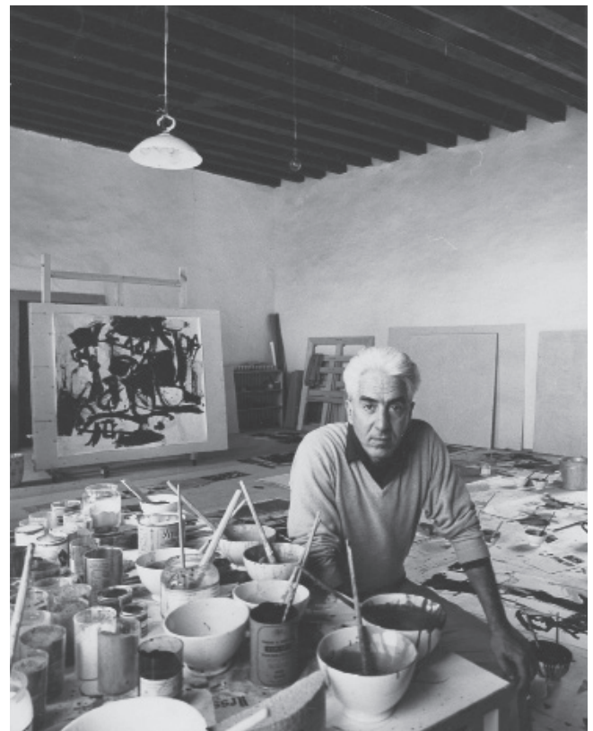
Afro in his studio in the Castello di Prampero, near Udine, 1963.

Numerous solo and collective exhibitions were held in the years that followed, and extensive research by art historians and critics consolidated Afro's renown, contributing to the ongoing discussion of his work, in Italy and abroad. Awareness of Afro's art grew and continues to grow over time, thanks also to the revival of interest in the various historical contexts, more than half a century ago, in which he played a role, as an Italian painter of international renown.