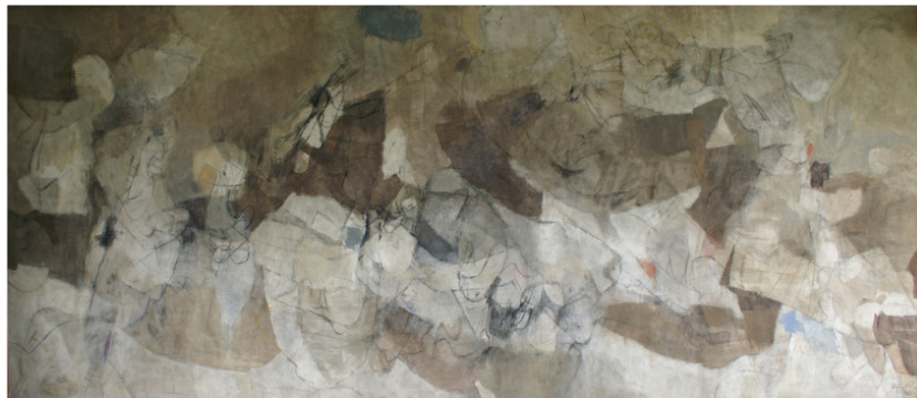
The Garden of Hope , 1958 Mixed media on canvas, 121 x 295.5 cm. ©UNESCO