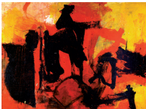
Porto delle Galere , 1964 Mixed media on canvas, 85 x 100 cm.