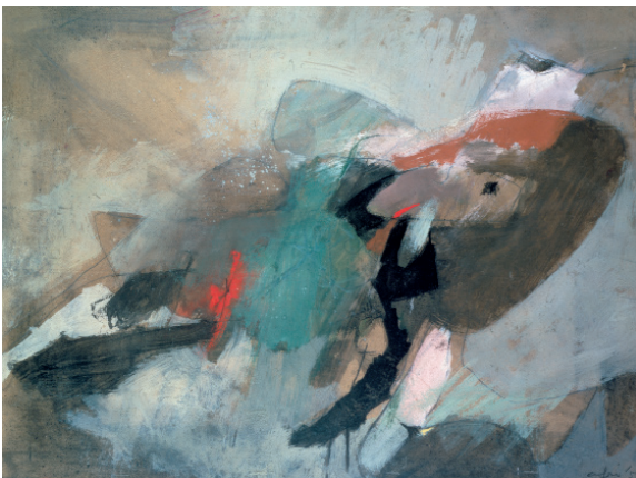
Study for The Garden of Hope , 1958

This exhibition, produced in collaboration with the Fondazione Archivio Afro, will present around 50 artworks from the 1940s to the 1970s, and the final room will be entirely dedicated to preparatory drawings of Afro's majestic mural fresco The Garden of Hope .