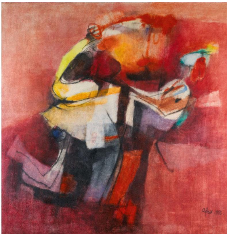
Ragazzo col tacchino, 1955