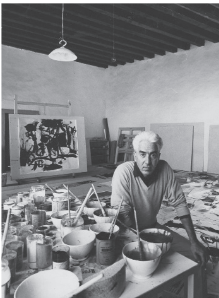
Afro in his studio in the Castello di Prampero, near Udine, 1963.