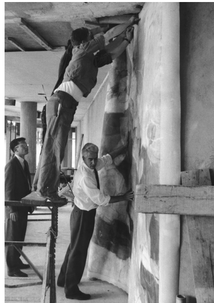
The artist (lower right) installing his canvas at the UNESCO's headquarters, Paris, 1958.