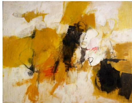
Colle Cieco , 1962 Mixed media on canvas, 125 x 160 cm.