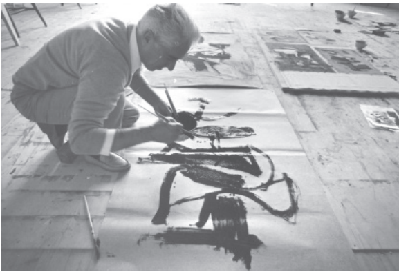
Afro, Castello di Prampero, 1963. ©Italo Zannier