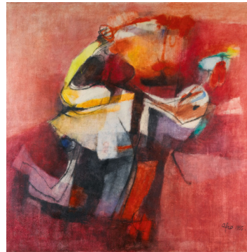
Ragazzo col tacchino , 1955 Mixed media on canvas, 144 x 144 cm. ©Fondazione Archivio Afro