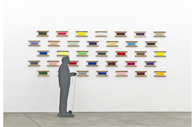
Fili , 2012, painted and enameled wood shapes, multi-color thread spools, various dimensions