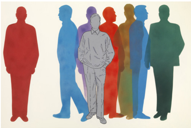
I protettori , 2007, mixed media on canvas on wood panel, 100 x 150 cm., (39,37 x 59,05 in.)