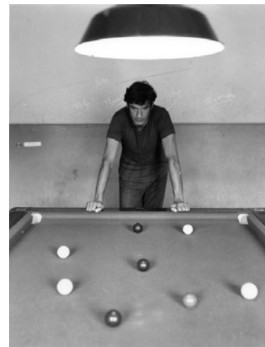
Renato Mambor, Araldica mobile 1969