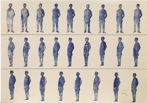
Timbri , 1964, stamp ink and marker on paper, 50 x 72 cm., (19,68 x 28,34 in.)