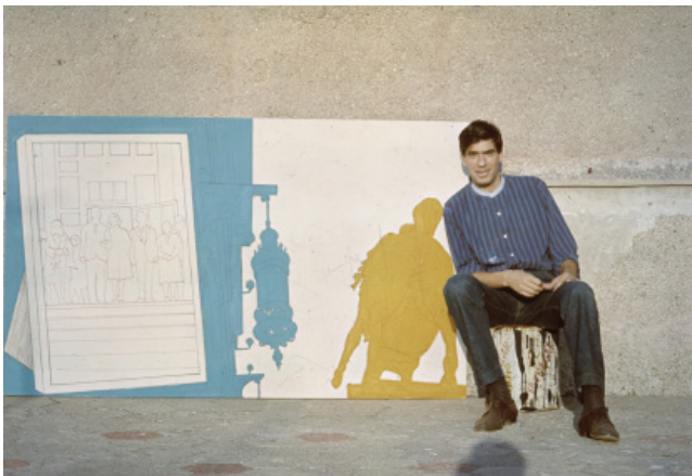
Mambor e Fotoricordo , 1966